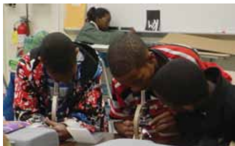
Camden County Middle School students peer through microscopes that were purchased with a Bright Ideas grant from Albemarle EMC.

Held each year, Bright Ideas is a program whereby teachers submit grant applications to compete for a combined $10,000 worth of funding. Grants are used to fund classroom projects that would otherwise lack the necessary funding.