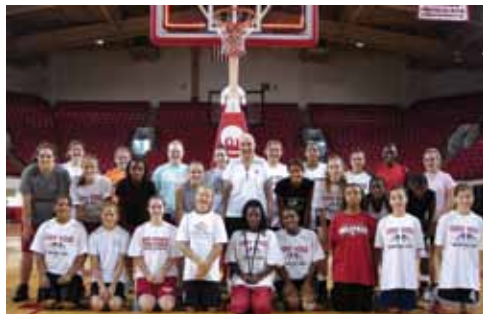
The late Kay Yow (back row, center), who coached the N.C. State Women's Basketball team, poses for a group photo with basketball camp attendees.

Both camps will be conducted by players and coaches from each team. Attendees will be taught fundamentals that will help both on and off the court.