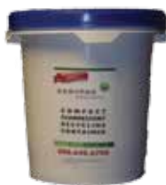
This container will be used to store and transport CFL bulbs to the recycling center.

Albemarle EMC will only accept unbroken CFL bulbs for recycling. Members can bring the bulbs to the co-op's office at 159 Creek Drive, Hertford and leave them with a member service representative. According to state and federal regulations, fluorescent bulbs can be disposed of by double-wrapping them in a plastic bag and placing them in the garbage.