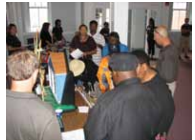
Members check out energy efficiency displays at the 2008 Annual Meeting.

Members who register before 2 p.m. will each receive a $2 bill. In addition, cash prizes will be awarded. To be eligible for prizes, a member must be present during the drawing.